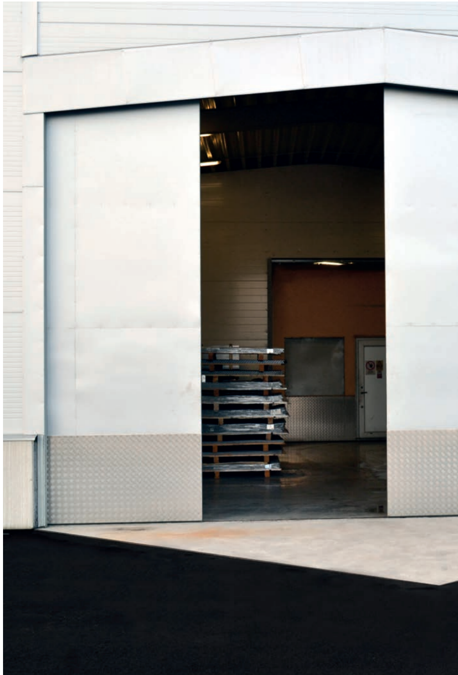
Top hung bi-parting storage bay doors enable ease of logistics in a Swedish warehouse complex.